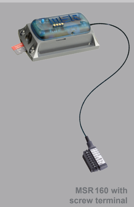
MSR 160 with screw terminal

Four analogue inputs, a high measurement rate and its gigantic memory capacity, all packed into a small format are the key characteristics of the new MSR 160 data logger. The analogue inputs of the robust mini logger can be used for conventional sensors with analogue outputs (e.g. CO 2 , conductivity, pH etc). In addition, a multiple output switching power supply is also provided.